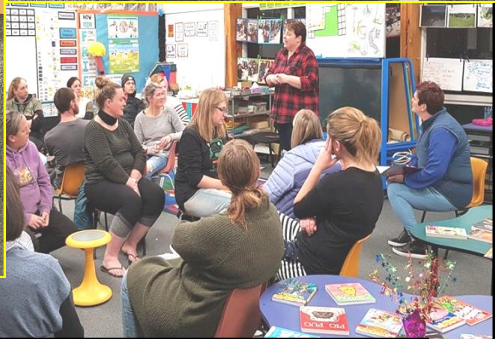
On Thursday night our first Reading Together session was held with a great turn out from Waikite Valley School and Kindy parents and children.