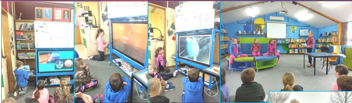
Room 4 sharing their Home Learning on Planets & Toys & Games from the past and present.