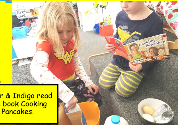
Ryder & Indigo read the book Cooking Pancakes.